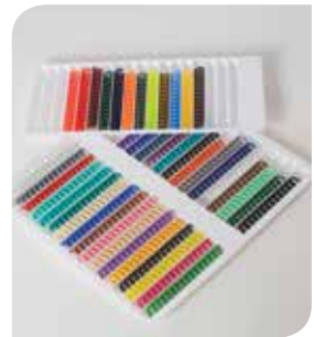
Spiratex Colour Options